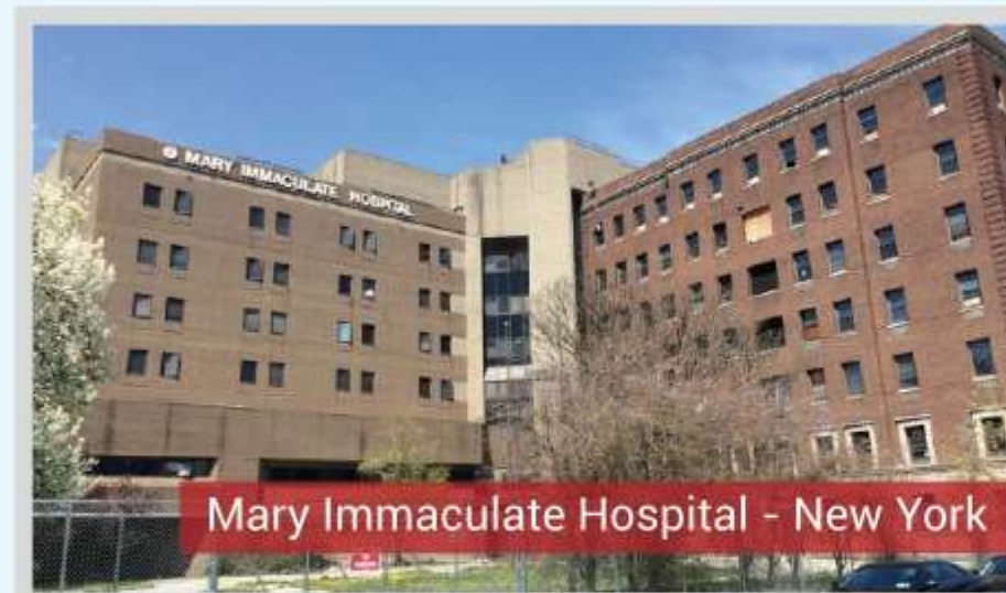
Mary Immaculate Hospital - New York