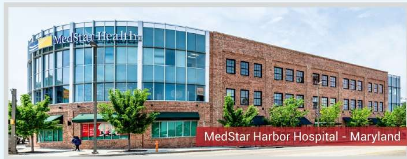
MedStar Harbor Hospital - Maryland