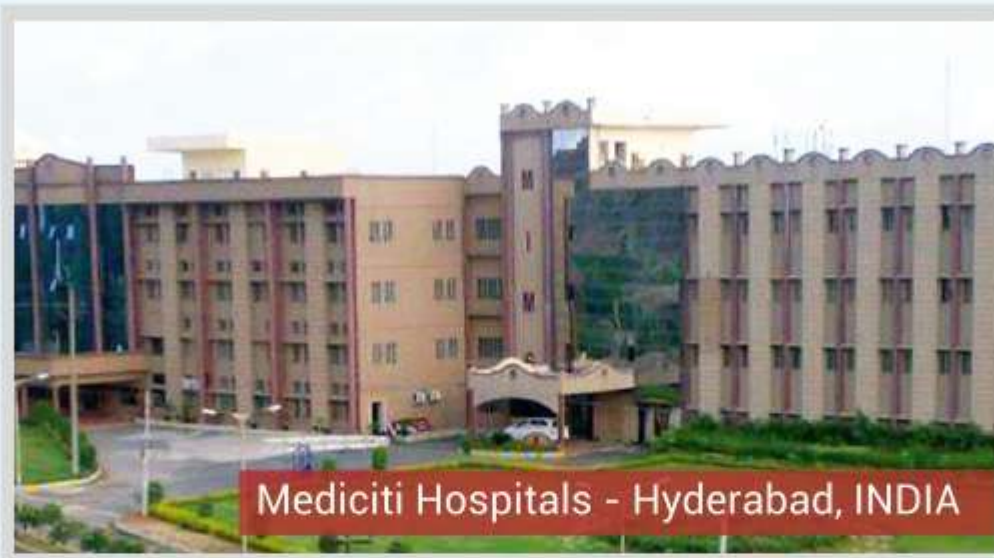
Mediciti Hospitals - Hyderabad, INDIA