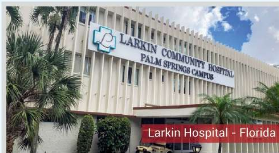
Larkin Hospital - Florida