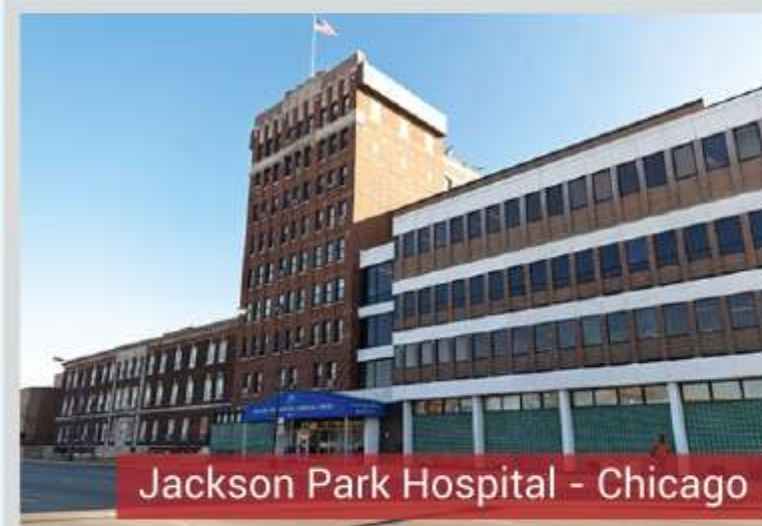
Jackson Park Hospital - Chicago