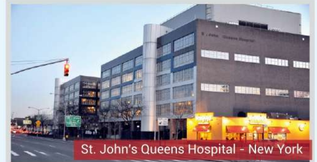
St. John's Queens Hospital - New York