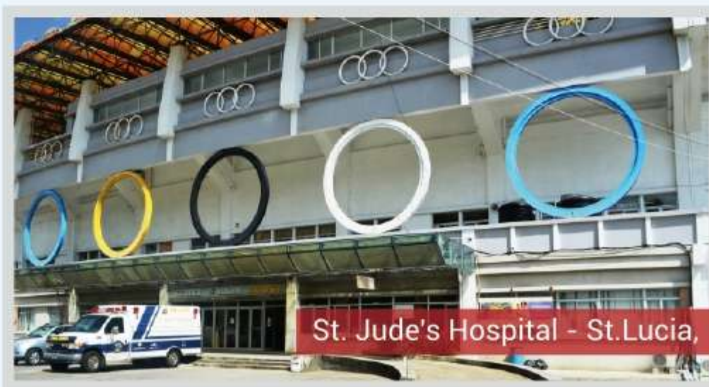
St. Jude's Hospital - St. Lucia